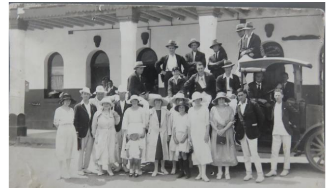
Canberra Co-op store cricket outing to Gidleigh Station, 1923.