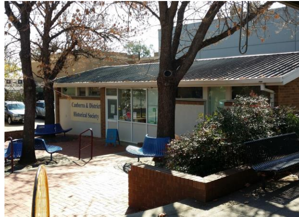
The Canberra & District Historical Society resource centre at Curtin Place, Curtin.