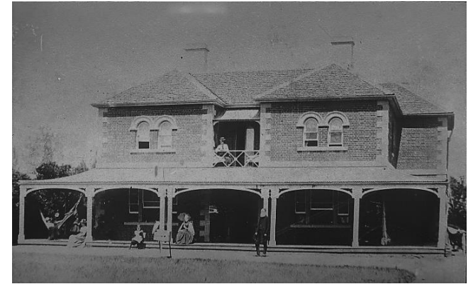
Glebe House rectory (nd). FW Robinson Collection, CDHS. One of the Society's first campaigns was to save this building but it was demolished in 1954.