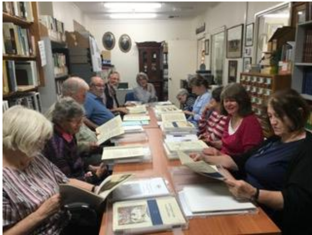
Engrossed in the Jefferis and Whelen Journal 'Around Australia's Capital'. ACT Heritage Festival, April 2018.